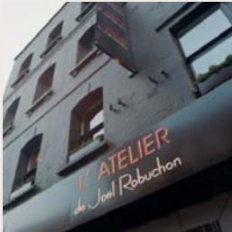
L'Atelier De Joel Robuchon West Street, London WC2H