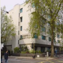
The Cromwell Hospital London SW5