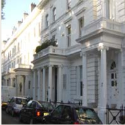
Flat at Cadogan Square London SW1